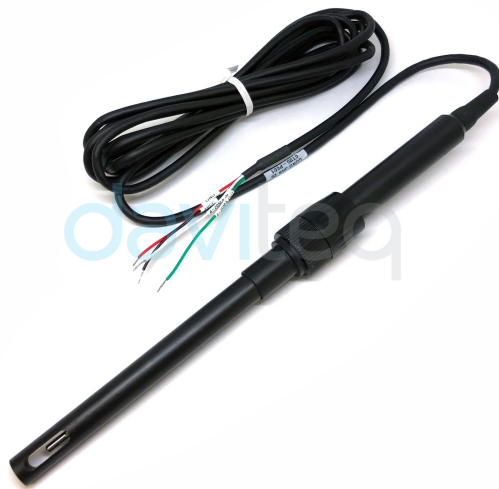
ECONOMY CONDUCTIVITY SENSOR WITH MODBUS OUTPUT MBRTU-EC-CT25