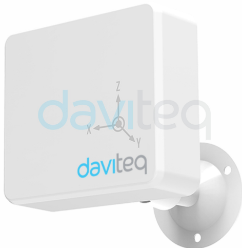
OCCUPANCY DETECTING SENSOR ODS