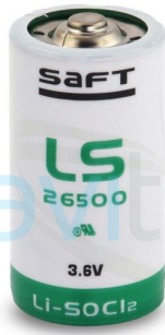
LS 26500 Lithium battery